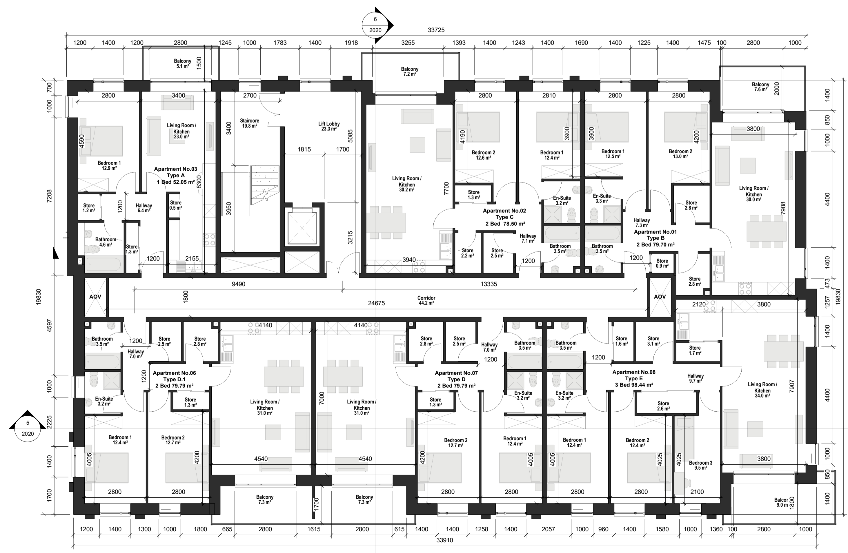
2 01 - Typical Floor Plan Block D 1 : 100