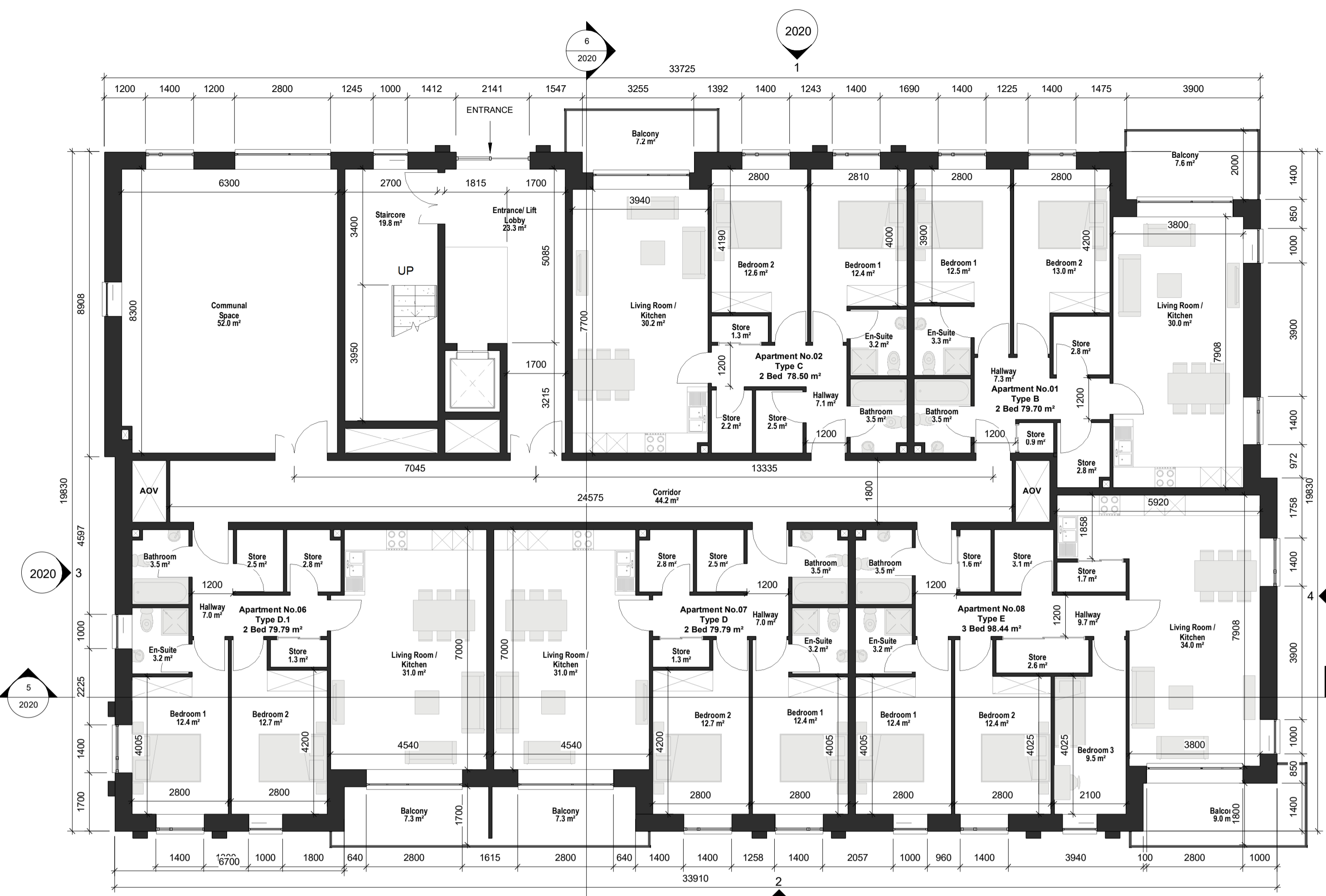
1 00 - Ground Floor Plan Block D 1 : 100