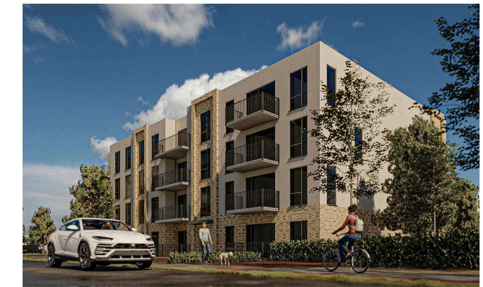
3 Indicative 3D View